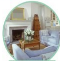
Cabin or Second Home